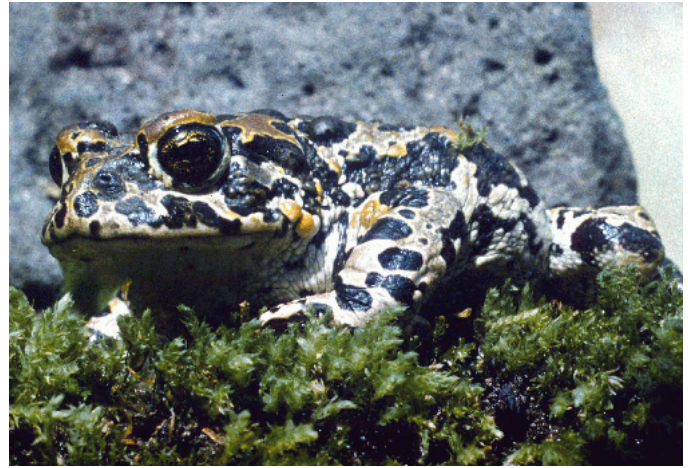
"Frog" by Dwight Buzick