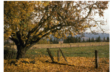
"Autumn on the farm" by Dwight Buzick