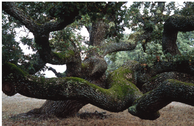
"Convolutd Tree" by Dwight Buzick