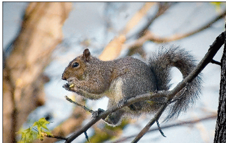
"Western Grey Squirrel enjoys shoots" by Jim Hawkins