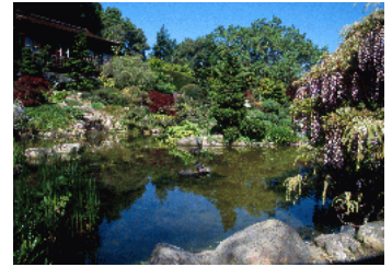
"Garden Pond" by Dwight Buzick