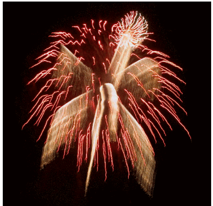
"Fireworks #14" by Dwight Buzick