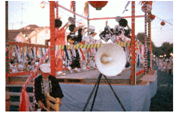
"San Jose Obon Festival 1962"