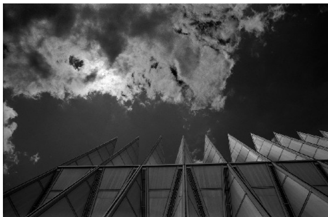
"US Air Force Academy Chapel, Colorado Springs"